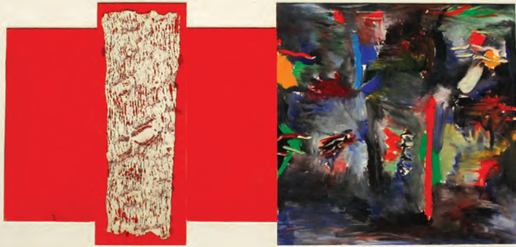
Untitled , David Trowbridge, circa 1985

but there were certain elements that Pop artists shared with others working during the 1960s.